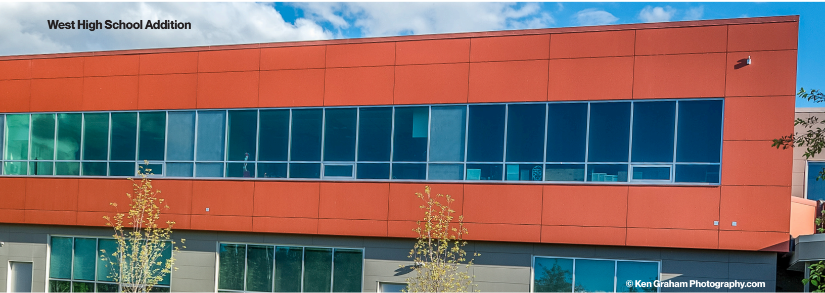
West High School Addition

MEG Quick Ship Program (QSP) Exterior Panels are as durable as they are beautiful. Designed to withstand all weather conditions, panels are available in a variety of vibrant and neutral design options and dimensions, allowing you to create an unforgettable impression.