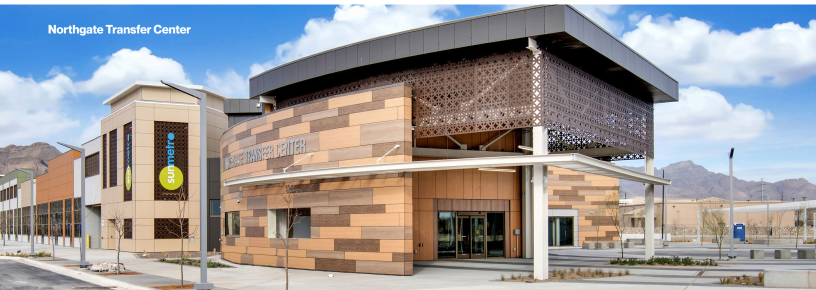
Northgate Transfer Center