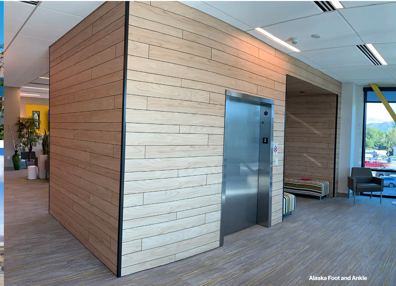
Alaska Foot and Ankle

With countless features and a vast design offer, ABET USA interior architectural panels forge limitless expressions. Add design flair and create spaces that inspire sophisticated, clean, and durable interiors.